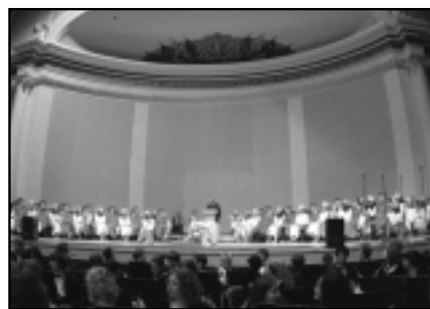
George Mason High School Seniors participate in graduation exercises at DAR Constitution Hall. Many were participants in the school's acclaimed International Baccalaureate (IB) Program. Those who successfully completed the requirements for the full IB diploma will be recognized for that achievement in the fall.

More information on the George Mason IB program can be found at www.fccps.org/gm/ .