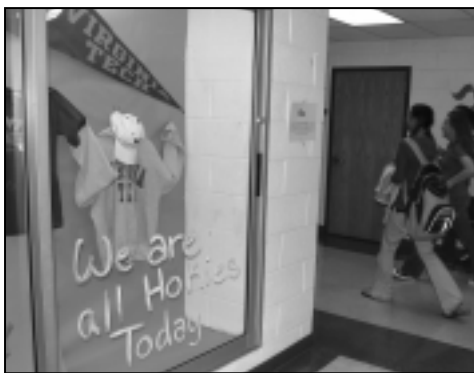
A display case inside the school lobby provided signs of support for those who are struggling to cope with the sad events on the Virginia Tech campus.