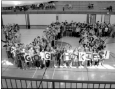
In a show of sympathy and support for those affected by the recent shootings at Virginia Tech, maroon and orange clad George Mason High School students form the familiar university logo in the high school gym. The brief rally took place on a national day of mourning.

Students throughout the Falls Church City Schools showed signs of sympathy and support in the wake of last week's shootings on the Virginia Tech campus. In all schools, students and staff wore the university's colors, orange and maroon, on Friday, which was declared a national day of mourning. Over the past five years, more than 50 George Mason High School graduates have enrolled in Virginia Tech, and nearly 40 are still in attendance. In addition, several FCCPS employees children attend the university, and some faculty members are related to Virginia Tech faculty and staff members.