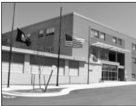
Flags at all Falls Church City public schools were flown at half staff in memory of the university students and faculty who lost their lives.